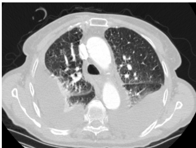
Figure 2. Full body computed tomography.